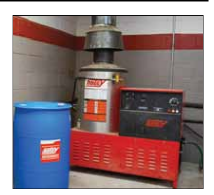
Identical footprint allows for older 900/1400 models like this one to be easily upgraded

Models are ideal for heavy-duty cleaning in farming, construction, transportation, automotive, manufacturing as well as any business washing a fleet of vehicles or heavy equipment.