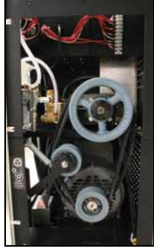
Total System Solution

Detachable panel allows access to wiring and control panel hub.